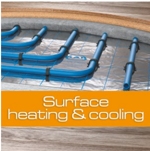
Surface heating & cooling

KAN was established in 1990 and has been implementing state of the art technologies in heating and water distribution solutions ever since.