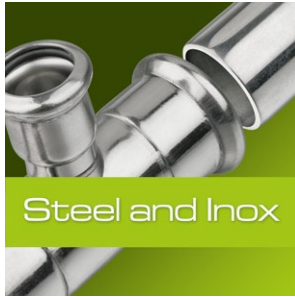
Steel and Inox